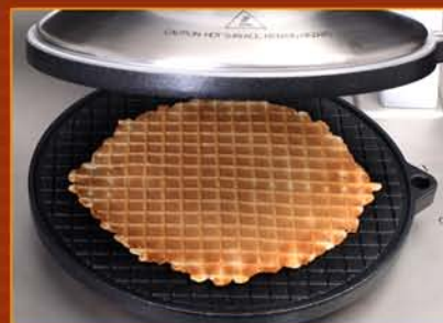
MAKES A PERFECT WAFFLE CONE EASY!