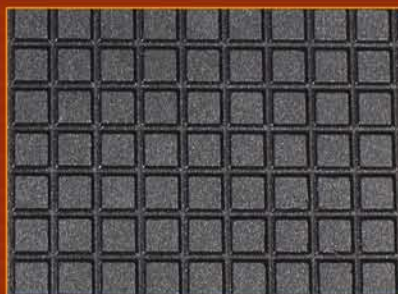
REMOVABLE TEFLON GRILLS