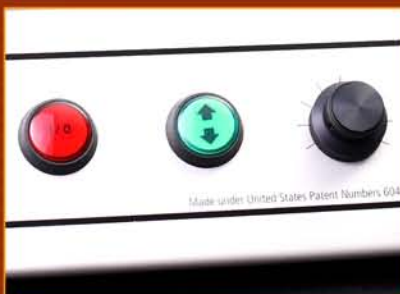
AUTOMATED GRILLING CONTROLS